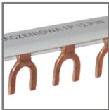
busbar contacts made of high-quality copper